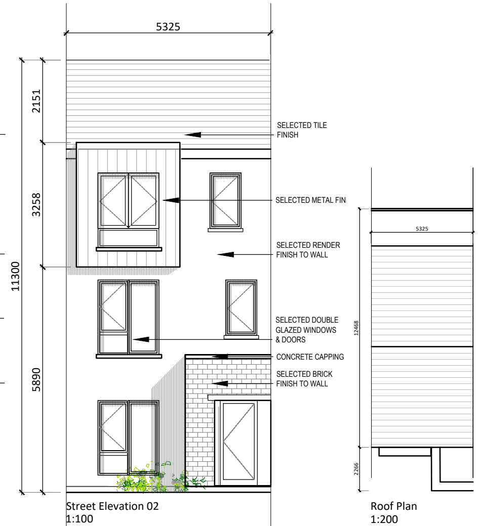
Roof Plan 1:200